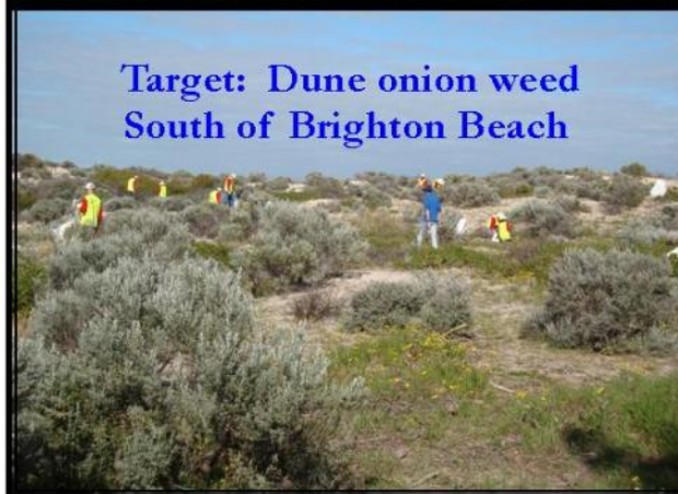
Target: Dune onion weed South of Brighton Beach